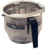
FUNNEL AY,W/DECAL GRT "C"7.62