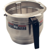
FUNNEL AY,W/DECAL GRT "C"7.12