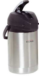
AIRPOT, 2.5L SST LA SINGLE PK