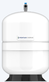
35L (5-gallon) hydropneumatic tank