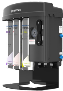
EZ-RO 375/35L-BL with optional floor stand bracket