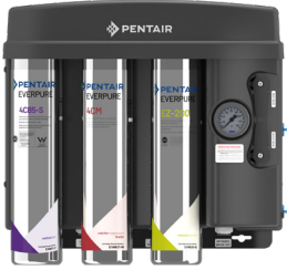
EZ-RO 375/35L-BL wall mount